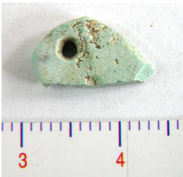
Fig. 3. Turquoise bead (1.2x0.7x0.3 cm) from the Orlovo prehistoric site, Regional Historical Museum Haskovo.

Coal (Jet). The gemmological name jet is generally employed in most countries for a black hard, fossilized coniferous wood, which is capable of being carved and can be highly polished. Jet is an