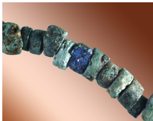
Fig. 2. Malachite (with azurite bead in the middle) beads in a necklace from the Durankulak necropolis, Historical Museum Dobrich NK1441-3, diameter of beads 0.2-0.5 cm.

Serpentinite. Serpentinite is a rock composed mainly by chrysotile \text{Mg}_3\text{Si}_2\text{O}_5(\text{OH})_4 , antigorite (\text{Mg},\text{Fe})_3\text{Si}_2\text{O}_5(\text{OH})_4 and lizardite \text{Mg}_3\text{Si}_2\text{O}_5(\text{OH})_4 , formed after ultrabasic rocks. This rock is widely used as raw material in the Neolithic and Chalcolithic of Bulgaria. At the Kovachevo prehistoric site the serpentinite artefacts are ~50% among the lithic materials (Kostov, 2007a). The serpentinites