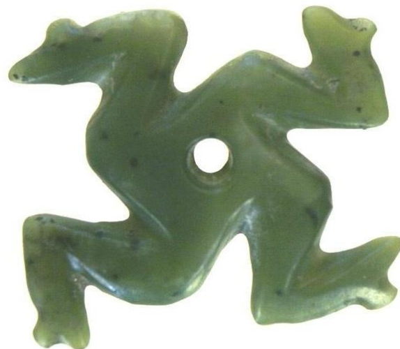
Fig. 1. Nephrite artefact (axe fragment, 4.6x3.6x0.9 cm) N30939; Kovachevo, Blagoevgrad region, Early Neolithic (left) and zoomorphic nephrite amulet N4532; Regional Historical Museum Kurdjali, Early Neolithic, 4.2x3.7 cm (right).