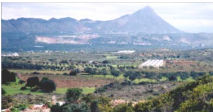
Picture 1. A characteristic aspect of the considerably heterogeneous landscape of Crete (Omalos plateau).

The structure of the spectral signatures input in the classification was based on the CORINE nomenclature, which consists of 3 item levels. In two cases, a 4 th level was added to the classification scheme, namely "Greenhouses" in class "2.1.1-Non irrigated arable land" and "Citrus plantations" in class "2.2.2-Fruit trees and berry plantations". The Bayesian technique (Maximum Likelihood with use of probabilities) was applied to the images and a total of sixteen classes were identified in the classified maps (different number of classes in each scene).