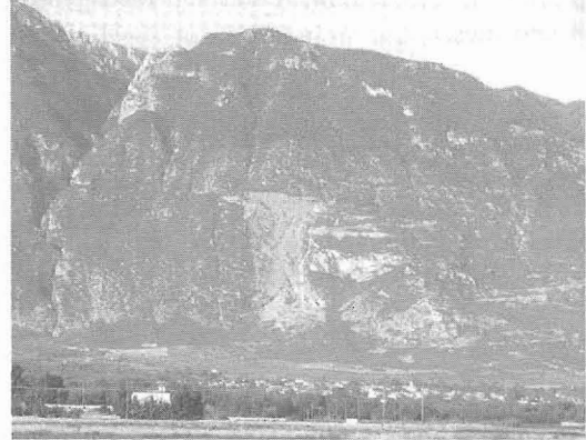
Figure 2 - Aspect of the locations where the bauxite mining activity was developed. With the lightcolor blots, the more important exploitations of bauxite and the depositions of aggregates materials are distinguished, in the Dio Vouna (a) and Mexiates (b) localities

Geologically, the region of research is structured mainly, from sedimentary shapings, that are included geotectonically in the Parnassos- Ghiona and the Sub-Pelagonic series, while in the Koumaritsi locality a small appearance of Peridotite is located. Specifically, regarding to the area Parnassos - Ghiona series, in which the hauxite horizons are located and the mining activities exploitation take place in the wider region of "National Park of Iti", a neritic carbon sequence is constitutes (upper Triassic - upper Cretaceous) and closes with Flysch (Eocene). This neritic