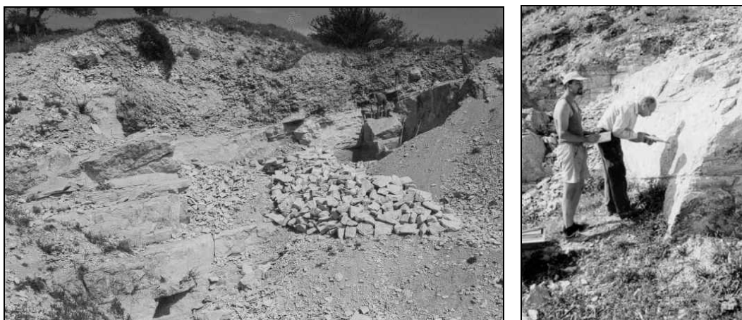
Figure 3, 4. Open limestone quarry from Slava Rusa, when carried out "in situ" tests

By comparing the results obtained for the compression strength with those subsequently determined by direct tests, the validity of the calculus relation was proved, the obtained mechanical resistances registering differences that can be included in the error tolerance limit. The correctness of the values of the longitudinal propagation velocity determined by the surface technique is verified, by comparing these values with the values of the propagation velocity measured with the direct transmission technique, insignificant differences existing between the two values